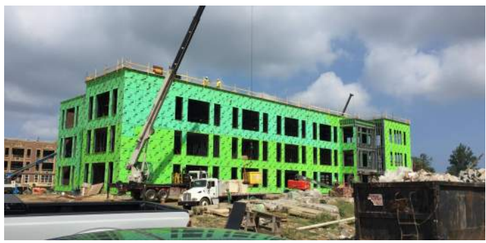
Area F Exterior Sheathing West Elevation