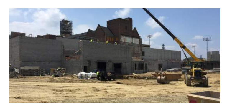
Area D Loading Dock Ramp Excavation