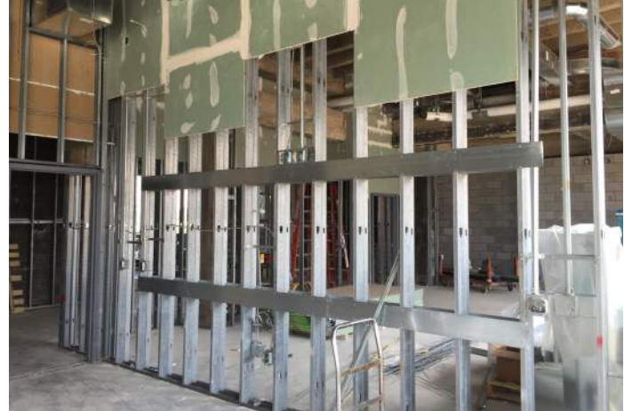
Area G Stud Framing, In-Wall Blocking & Electrical In-Wall Rough-In